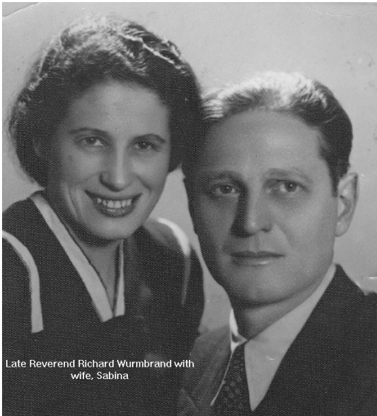
Late Reverend Richard Wurmbrand with wife, Sabina

Email: hfr@helpforrefugees.com ; Website: http://helpforrefugees.com