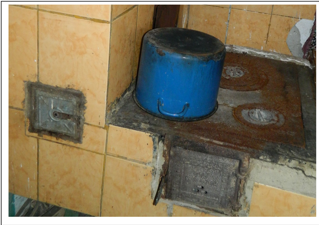
The Miserable Kitchen