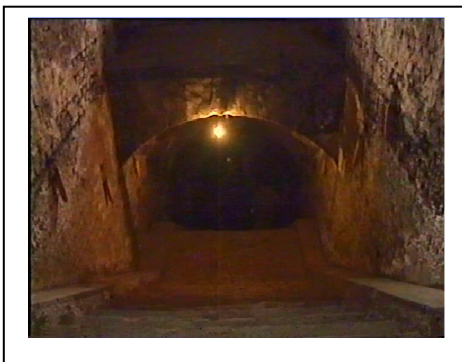
The Romanian Communist Jilava Prison: Entrance to the underground cells

Becoming one is not just coming together in worship, in agreement and with the feel "I am ok, you are ok." In the history of the church, often one Christian arose, someone considered insignificant yet this person made the difference by kindling again the Lord's glowing fire He brought on earth, of love for our fellow Christians.