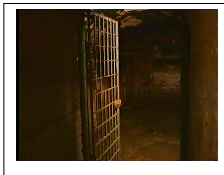
Totally dark Jilava cell where many Christians were held prisoners