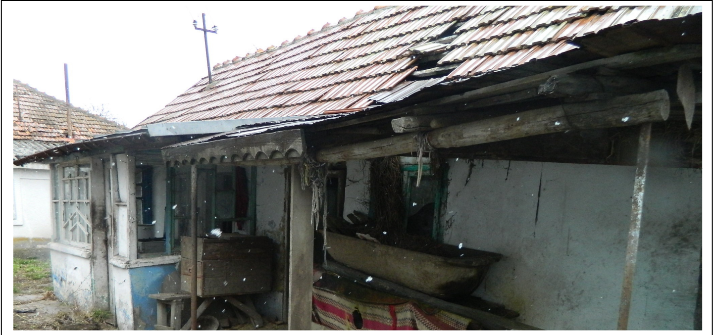
The Wretched Shack From Which The Nemtanu Children Were Rescued